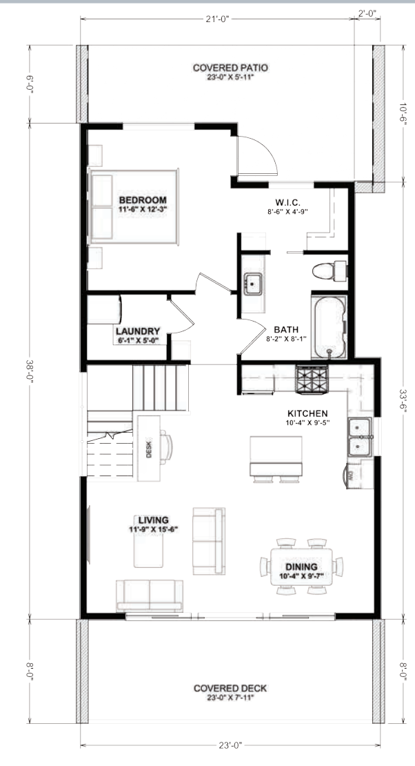
MAIN LEVEL (PLAN 9)

AREA: 513 SQ. FT. (EXCLUDING MECH) GARAGE: 277 SQ. FT.